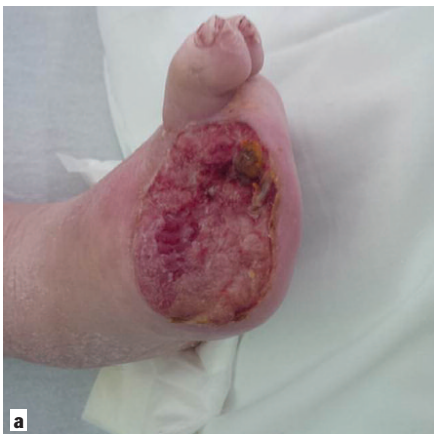
Figure 1a. Baseline presentation of an infected toe amputation site.

Chronic wounds are defined as wounds that do not heal in an orderly and predictable manner within six weeks. 26,27 Natural healing requires the host to mount a cellular response with proper migration of cells, thereby eliminating invading organisms or foreign