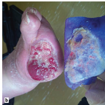
Figure 1b. Site after two weeks of treatment with a GV/MB dressing. Note the removal of slough and devitalized tissue by the dressing.