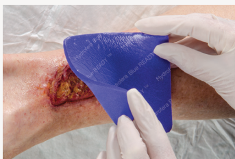
Place with printed film side up