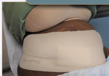
Supporting Incision at Risk of Further Dehiscence