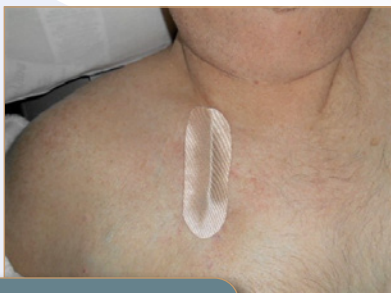
Chemo Access Port