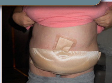
Transverse Abdominal Incision