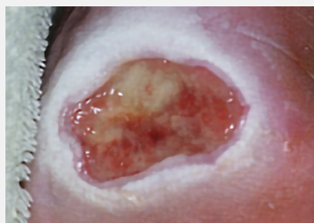
Periwound Skin Damage